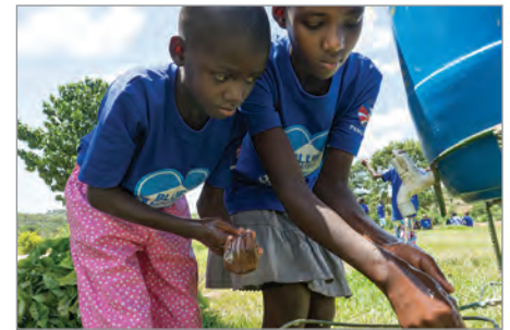
Primary school-age girls learn proper hand-washing methods.