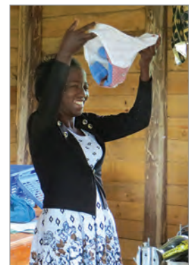
A woman from the sewing school showed how the RUMP fits into a pair of "knickers," a more affordable and ecological option to sanitary pads.