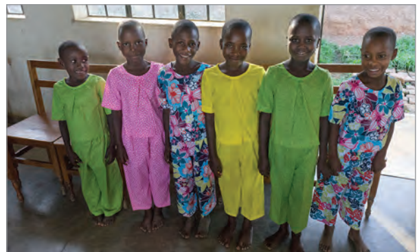
New play clothes bring smiles (p. 4).

More photos on our website at www.blue-house.org and Facebook.com/Blue.House.HMI