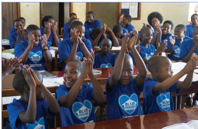
An energizer: Making rainstorm sounds.

More photos from The Blue House - Peace Corps Camp inside on pages 2 and 3