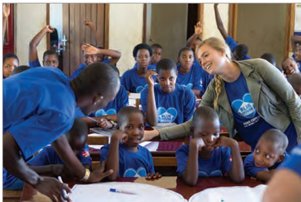
Mackenzie encouraged a shy girl in a nutrition exercise.