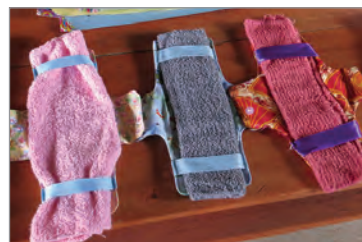
RUMPs are made with washcloths instead of banana leaves.