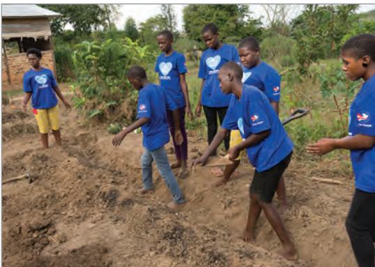
Everyone participated in digging and planting a permaculture garden at the Blue House. It's a technique that provides vegetables year-round, even in drought.