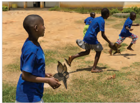
Mosquito tag! A girl with a cardboard mosquito tries to 'infect' her mates with malaria.