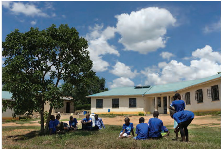
A beautiful day to learn about malaria, and the importance of using mosquito nets.