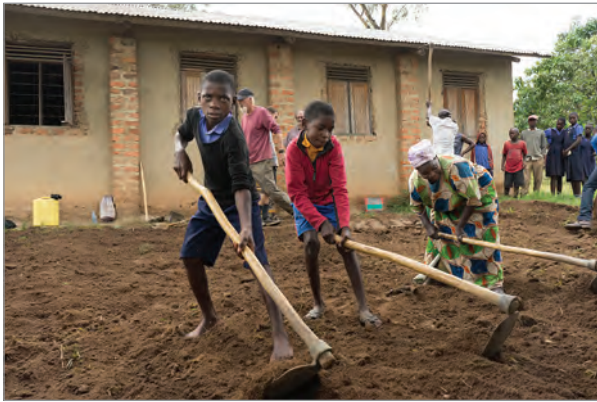
Kazo townspeople learned how to dig a demonstration permaculture garden. Water from the roof will drain rain into the deeply dug garden.