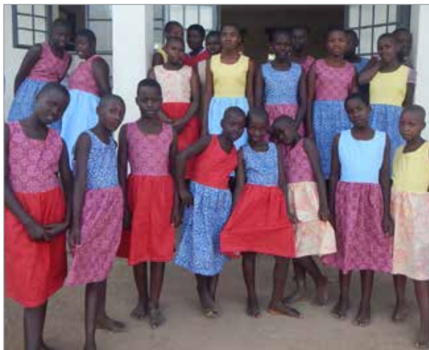
Some of the beautifully patterned dresses the Blue House girls designed and were tailored by UMN students (see story page 1).

Nonprofit Org. US Postage PAID Twin Cities, MN Permit No. 30308