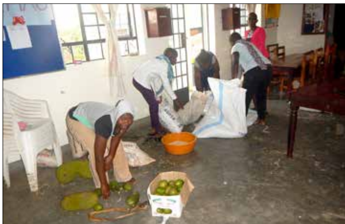
Unloading food at the Blue House. Jack fruit, mangoes and maize brought from the girls' homes back to the Blue House.

Girls are back in school after a long Christmas vacation which started at the beginning of December 2018 and ended in early February 2019. The girls stay with their relatives during the holidays to keep connected with their families. At the start of the school term each girl brought food gifts from their family to share at the Blue House. In addition, over 100 kgs of maize were harvested from the Blue House garden.