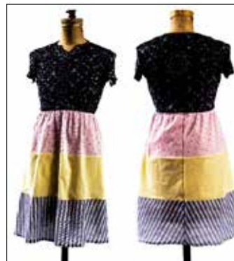
UMN students creating the pattern and a prototype;