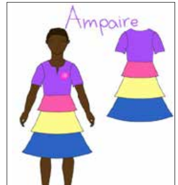
Turning Ampaire's vision into reality. The first sketch is now coming to "life"