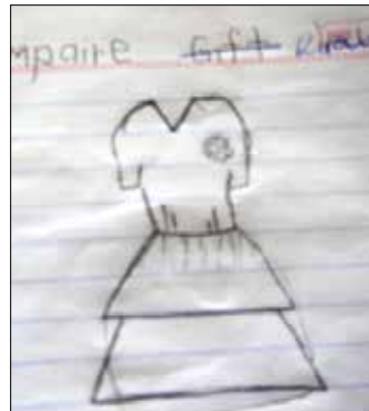
The inspiration, the art, the creativity. Creating her own fashion: An initial sketch by Ampaire

What a great opportunity for the Blue House girls to learn and be involved in the design of their dresses right from the start.