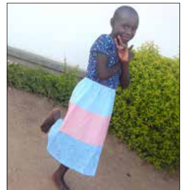
A very happy Ampaire models her beautiful final product.