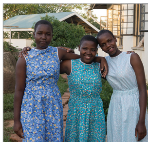
2016 - Lovely young ladies loving their blue print cotton dresses.