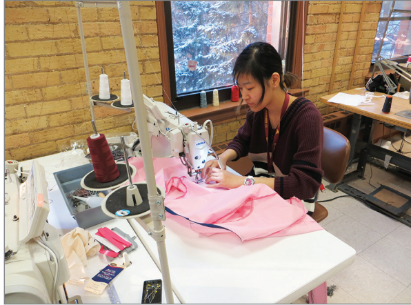
Across the globe, from a land of snow-covered trees, to a lucky girl who lives on the equator.