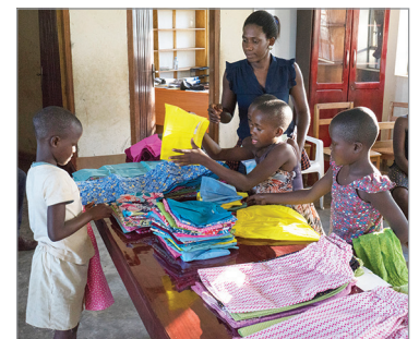
2016 - Better than shopping: the younger girls got first pick of tops, crops, and dirndl skirts.