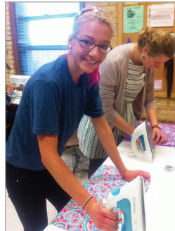
2012 - The University students attached photos of themselves making the sundresses. The Blue House girls sent back their own pictures holding the photos of the dresses they were wearing.