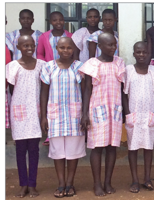
2014 - Play clothes were welcomed by girls who wear uniforms to school.