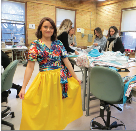
Modeling a colorful wrap top and gathered skirt. Other students inspected and sorted more clothing, soon to be sent to Uganda.