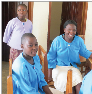
2013 - Fleece jackets made for walking to school on chilly (70°F) mornings.