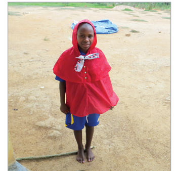
2012 - At the first sign of a sprinkle, Immaculate put on her poncho. The girls walk to school even during rainy season, and they really appreciate the coverage, including over book bags.