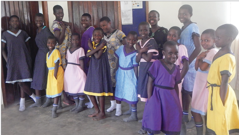
The younger girls look tickled to show off their new fashionable dresses.