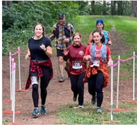
At the finish line: runners of all ages and skills participate in a 5K, 11K or 8 mile off-trail race.