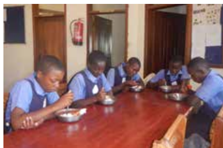
Lunch at Blue House, includes food from their own land, including beans, peanuts, and milk. Rice is purchased in large quantities.