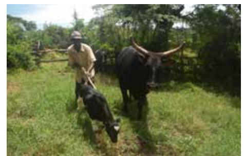
Blue House cows graze on the land, and provide milk.